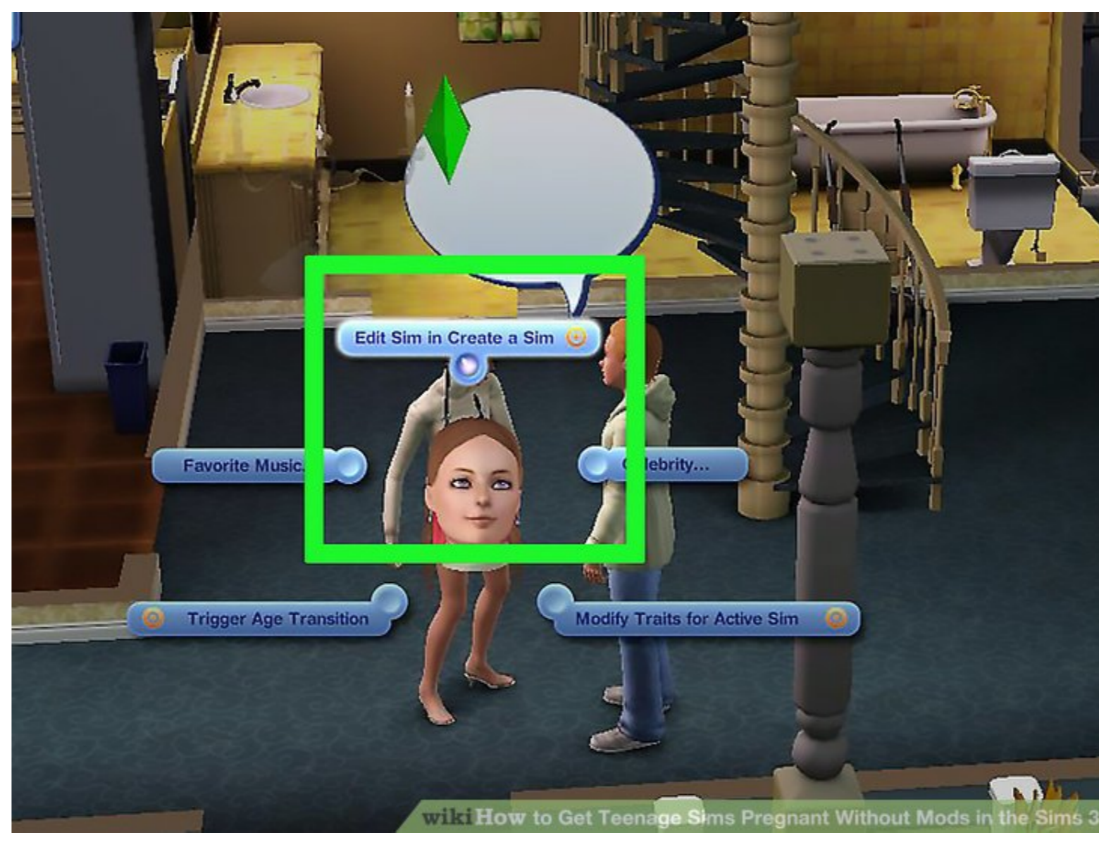
Sim 3 Miscarriage Mod